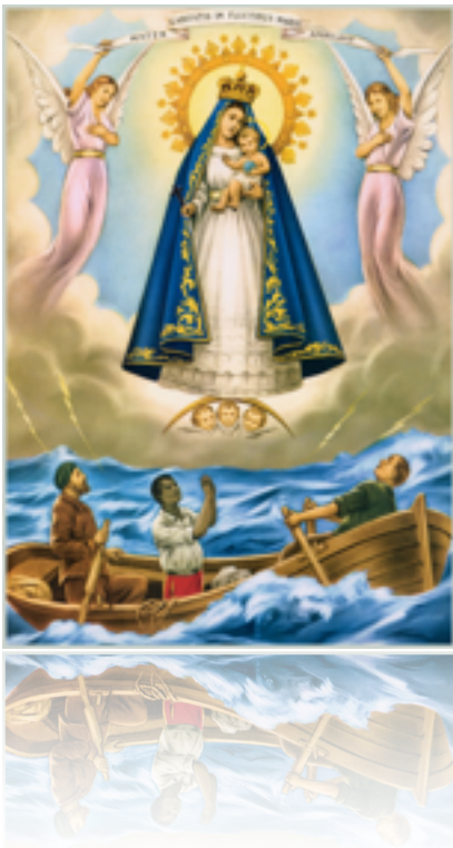
Our Lady of Charity - Pray for us!

http://schools.archchicago.org/high-schools